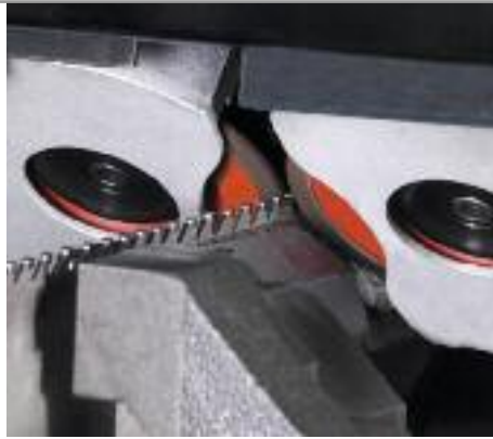
Tooth side grinding (CBF 400)