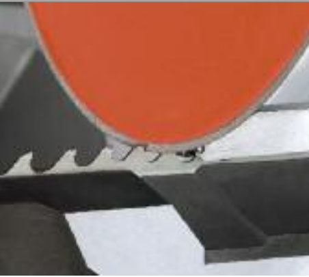
Tool face grinding