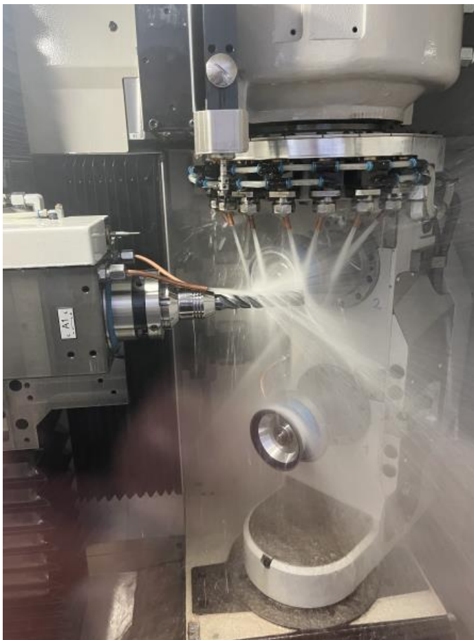
Caption: With the new VGrind 360 grinding machine from VOLLMER, InduGrind is taking the grinding of its carbide shank-type tools to the next level and also intends to produce large volumes of standardised drills and milling cutters in the future.