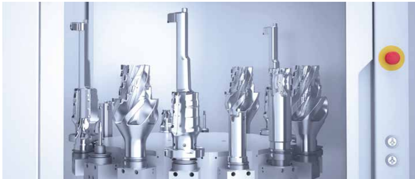
External magazine HR

This sign will help you to recognise machines that are already optimally prepared for an internal or external automation solution and are therefore the first choice for fully automatic complete processing.