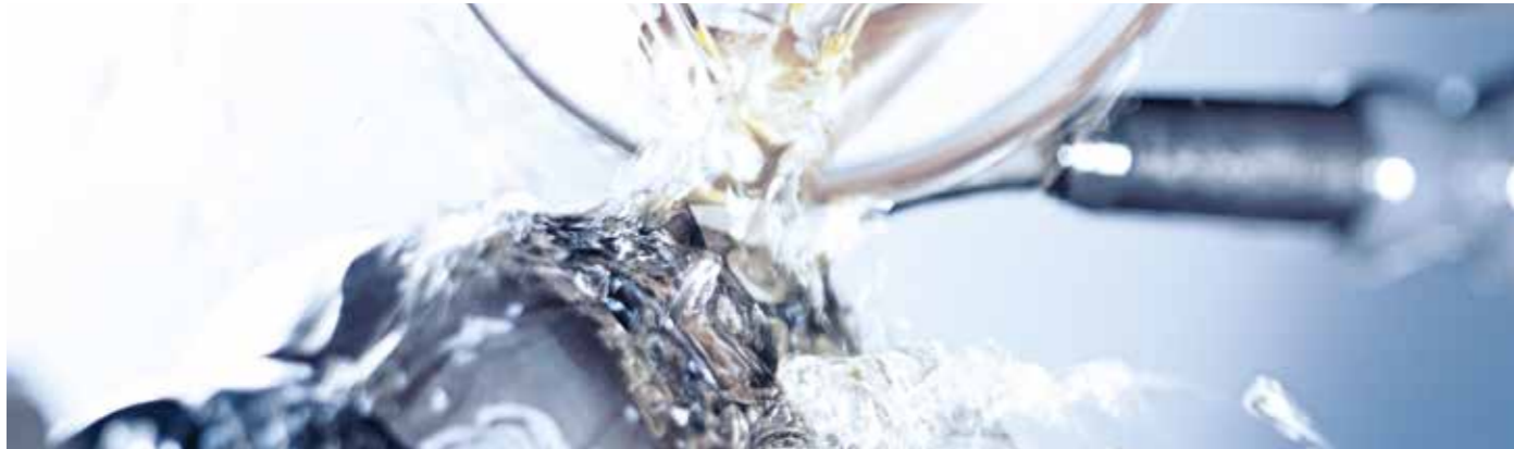
Highest precision for sophisticated tools

The high precision and surface finish attained means that the grinding stage is often not required when processing tools with VOLLMER machines.